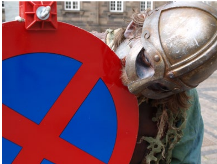
A Viking zombie eating a traffic sign in Copenhagen. Post-game.

dead zones in the sea. This represented the simple environmental idea that we can't debate forever and time is running out. In real life, the talk goes on and the situation gets worse invisibly under the sea, in the larp the problems shamble to the shore to attack the living. We thus made the problem concrete in a brute way.